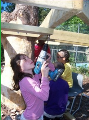
(left) King Henrys Walk