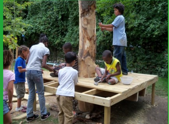
(right) Toffee Park children begin work on their tree houses